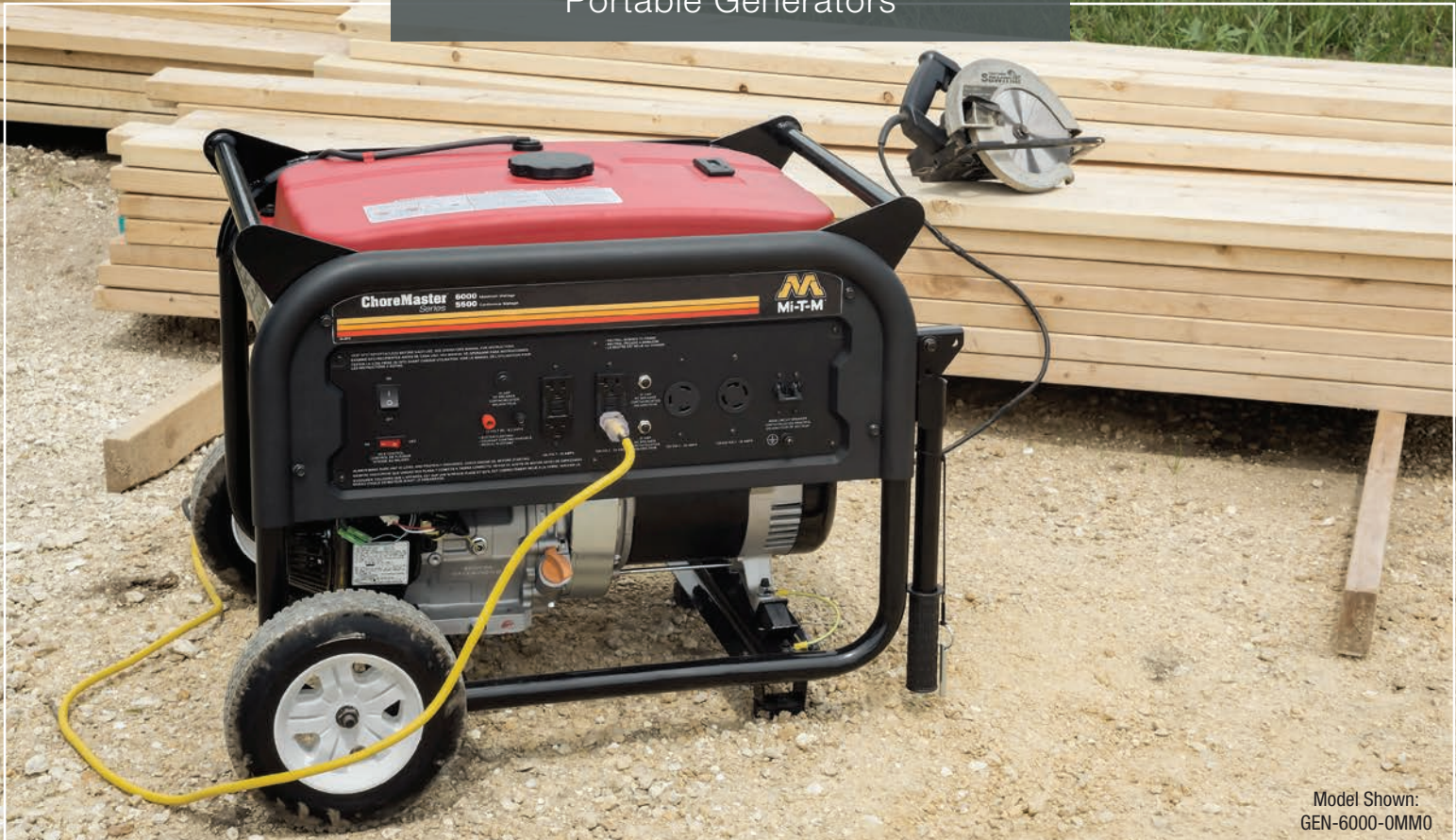
Model Shown: GEN-6000-OMMO