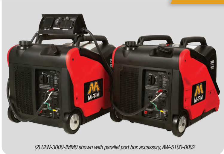
(2) GEN-3000-IMMO shown with parallel port box accessory, AW-5100-0002

Inverter generator ratings represent no-load sound levels. Noise level tested at seven meters (75% load). Rating represents minimum noise level rating.