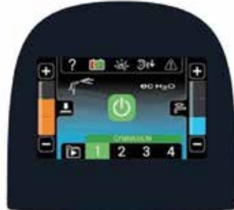
Pro-Panel® LCD Touch Screen (Option)